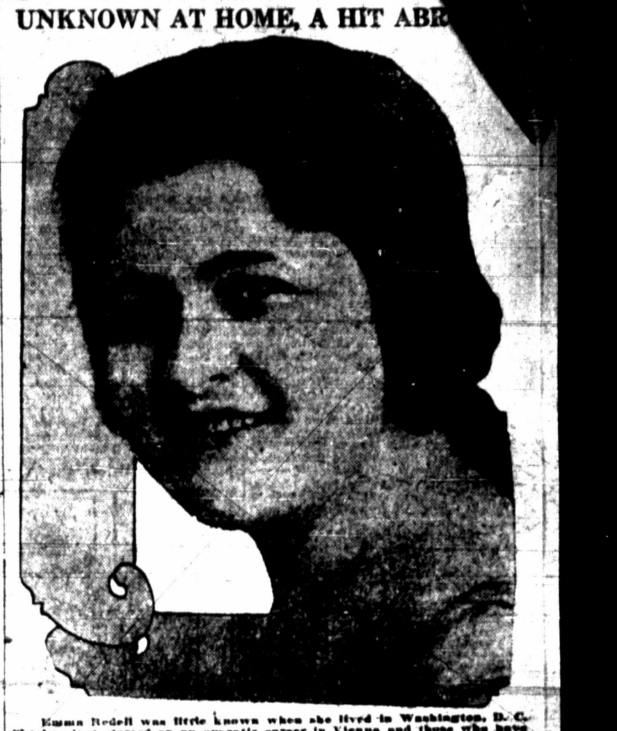
UNKNOWN AT HOME, A HIT ABOVE...