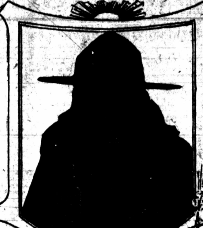
WM. S. HART in "The Three Word Brand" PARAMOUNT PICTURES