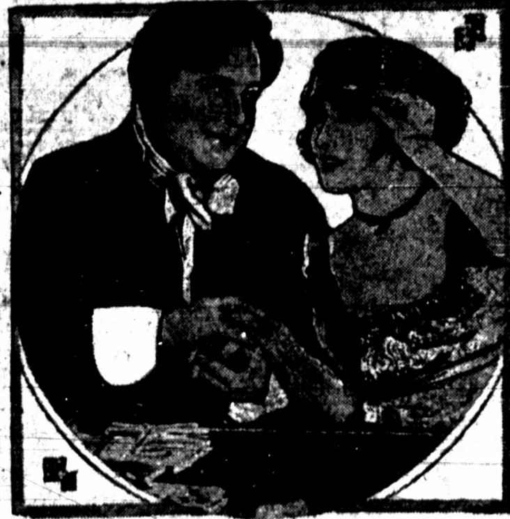
Mabel Ballin and Willard Louis in Hugo Ballin's production of Thackeray's 'VANITY FAIR'. Directed by Goldwyn.