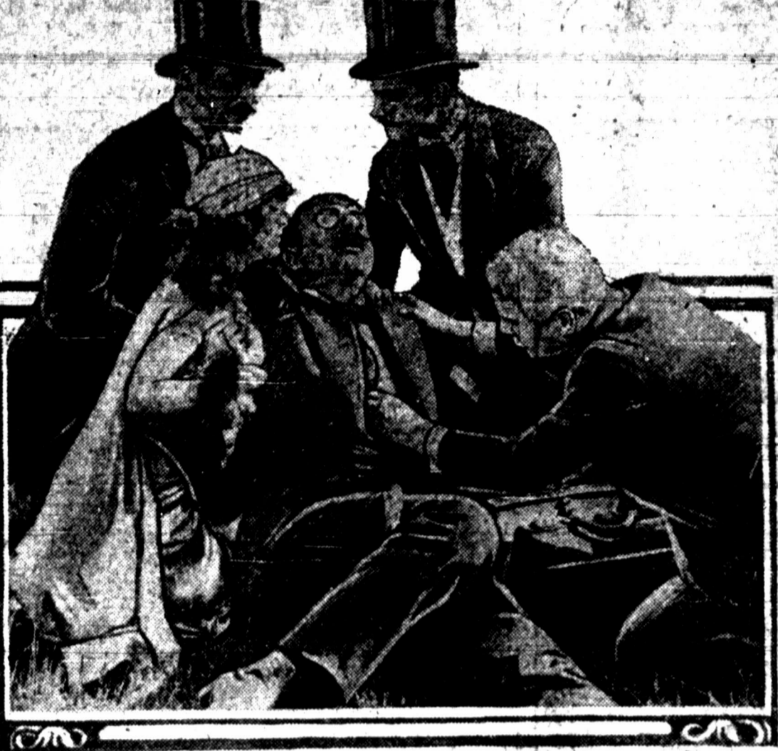
SCENE FROM "DAUGHTERS OF THE RICH," A PREFERRED PICTURE