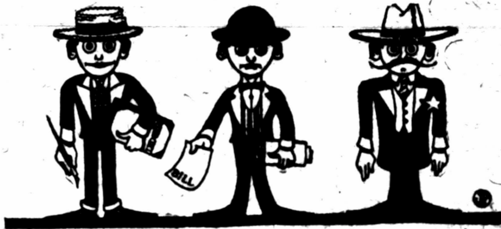
THREE OF A KIND Bookkeeper, Collector and Bad Check Chaser

Because we fired that all the first day we entered the retail grocery business we have set a standard for low merchandising cost that enables you to get bargains every day at the PIGGLY WIGGLY stores.