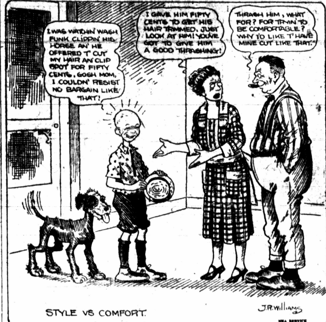
STYLE VS COMFORT.