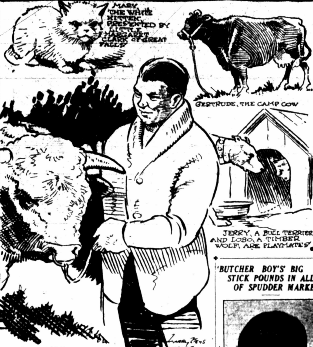
JACK DEMPSEY AND HIS 'FOUR-FOOTED FRIENDS' HE INTENDS TO BRING TO HIS FARM IN OTAH