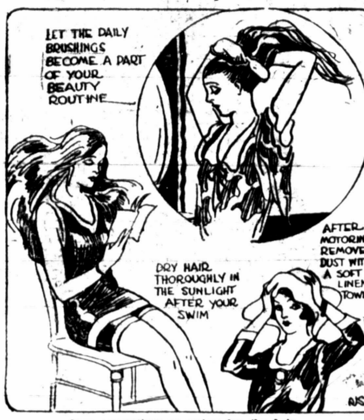
Some suggestions on caring for the hair.