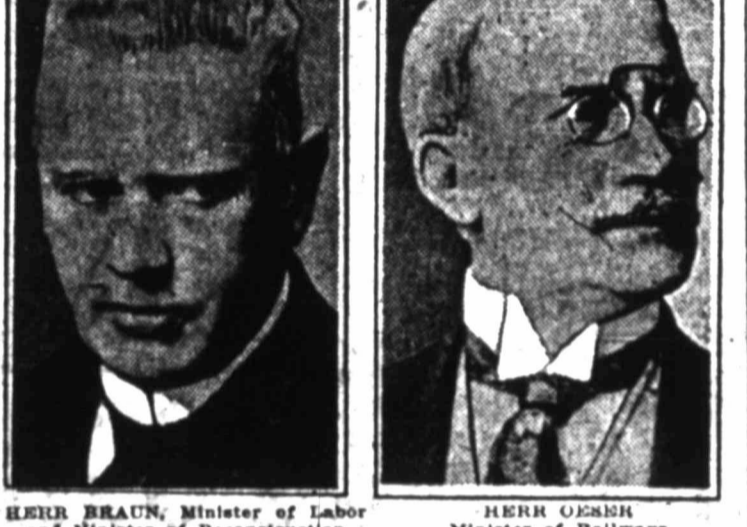
HERR BRAUN, Minister of Labor and Minister of Reconstruction