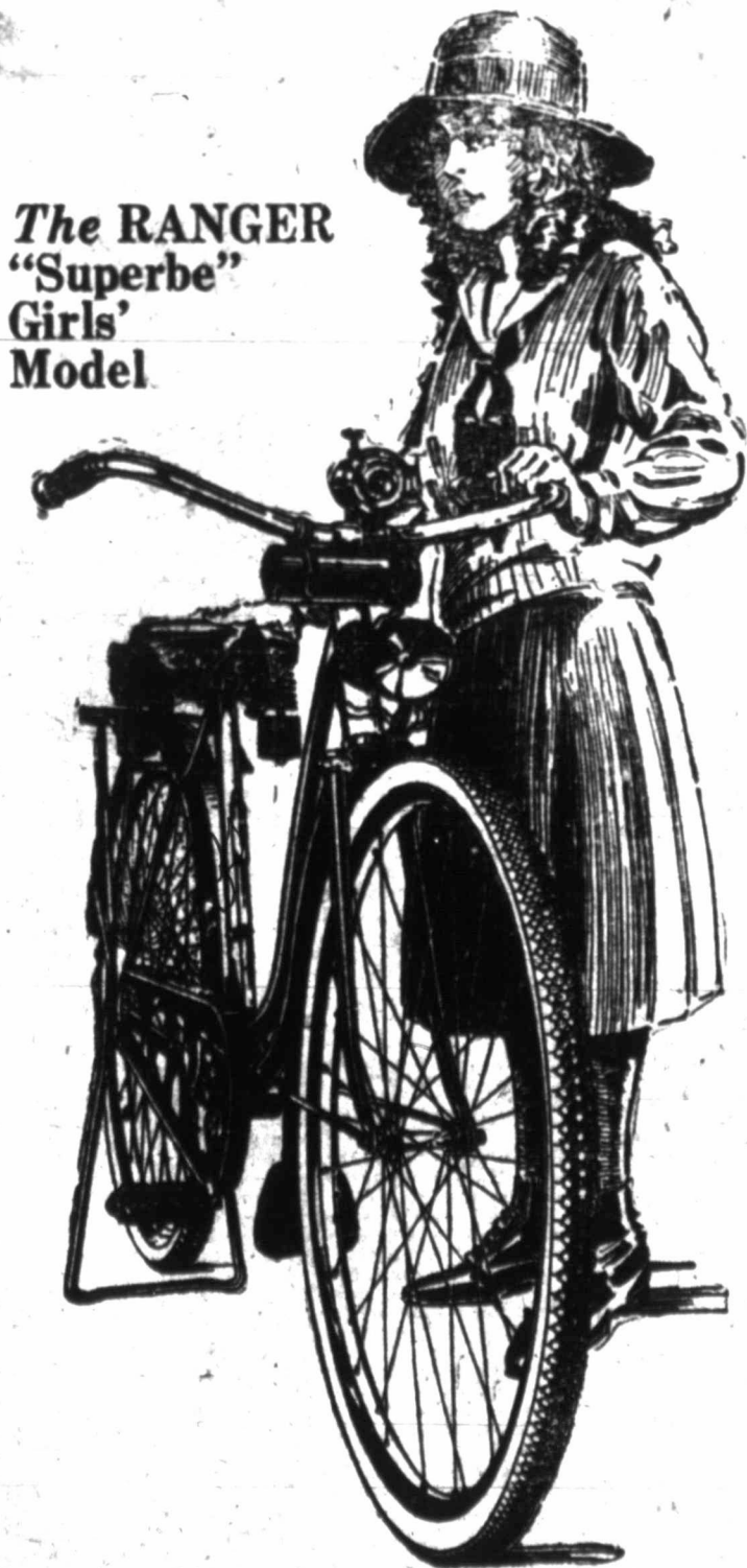
The RANGER "Superbe" Girls' Model

If you are not now a regular subscriber to The Daily and Sunday Times and would like to assist some boy or girl to win one of these $65.00 Rangers, telephone 4391 and ask for the Bicycle Campaign Manager. He will give you a list of the workers and you can select one who will call on you and take your subscription. One of these bicycles will be given to every boy or girl who turns in thirty-five new six months' subscriptions to The Daily and Sunday Times.