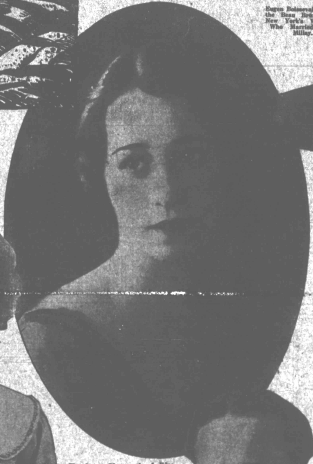
The Latest Photograph of Edna St. Vincent Millay.

out that at least one unique feature was accomplished in her marriage which is bound to endure. Eugen Boissevain, fascinating and wealthy Dutch importer has succeeded in successfully marrying two of the most talented, popular and beautiful young women ever to appeal to the imagination of this country. And both of them had vowed never to wed! The lovely Ines Milholland, known as the "most charming suffragette," was a proclaimed man-hater, and publicly asserted that never,