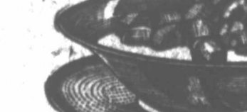
Puffed Wheat in milk at night

Serve with cream and sugar. Mix them in every dish of fruit. Crisp and douse with melted butter for hungry children in the afternoon. Millions of children are better fed because their mothers thus make whole-grain foods enticing.