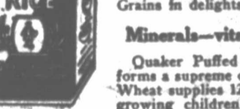
Quaker Puffed Rice