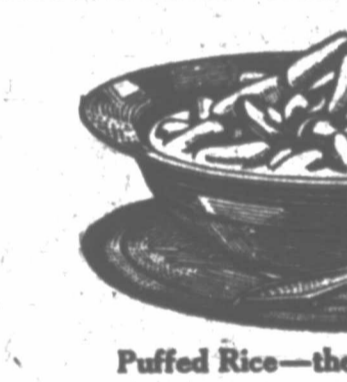
Puffed Rice—the morning dainty

It was a very enjoyable affair and afforded the new teachers in the city an opportunity of becoming better acquainted at the opening of the ensuing term of school. Delicious punch was served throughout the evening.