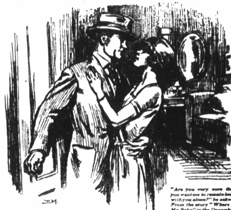
"Are you very sure that you want me to remain here with you alone?" he asked. From the story "Where Is My Baby" in the December issue True Story Magazine