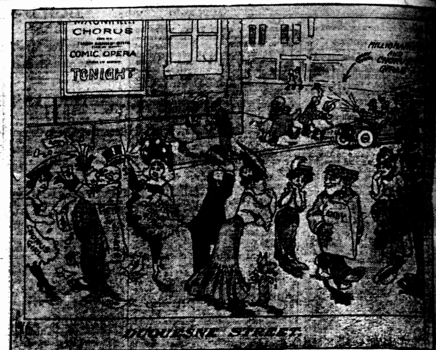
Anybody would know that this is Pittsburg. Find women from Atlanta.