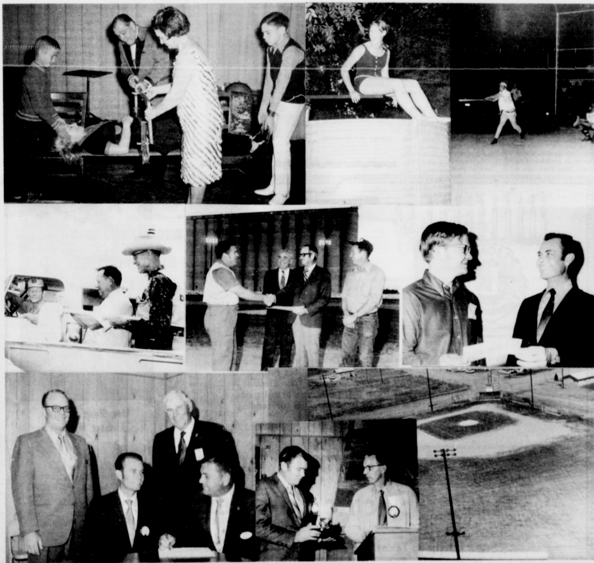
Pictorial Highlights Of Friona Lions' Activities During 1970-71 Club Year