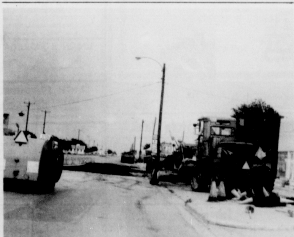
HIGHWAY WORK. . . A construction crew was busy in Friona at the Main Street-Highway 60 intersection, making repairs at the intersection. Traffic was routed around the construction.

The President went on to say, "American agriculture plays a fundamental role in this great objective...building a stronger and more lasting peace...by making us the best fed, the best clothed people in the world."