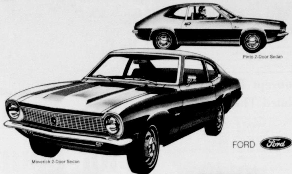
Maverick 2-Door Sedan