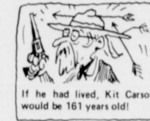
If he had lived, Kit Carson would be 161 years old!