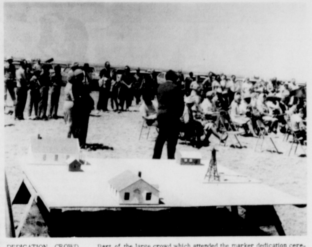
DEDICATION CROWD... Part of the large crowd which attended the marker dedication ceremony at Parmerton last Sunday is shown above. In the foreground is shown the scale model reproduction by Hugh Moseley of some of the buildings that were located at Parmerton at the time it served as county seat.