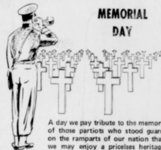
A day we pay tribute to the memory of those patriots who stood guard on the ramparts of our nation that we may enjoy a priceless heritage of freedom.

Baird Representative — JIMMY GODFREY UL 4-1333