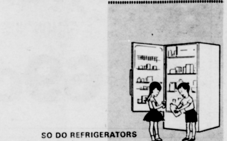
SO DO REFRIGERATORS