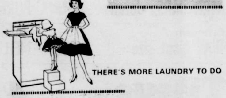
THERE'S MORE LAUNDRY TO DO

Year in, year out—electricity provides you with more real service per dollar spent than any other item in your family budget, but it takes hot weather to show up electricity's BIGGEST value. The average WTU residential customer is paying an average of 18% less per KWH than in 1953.