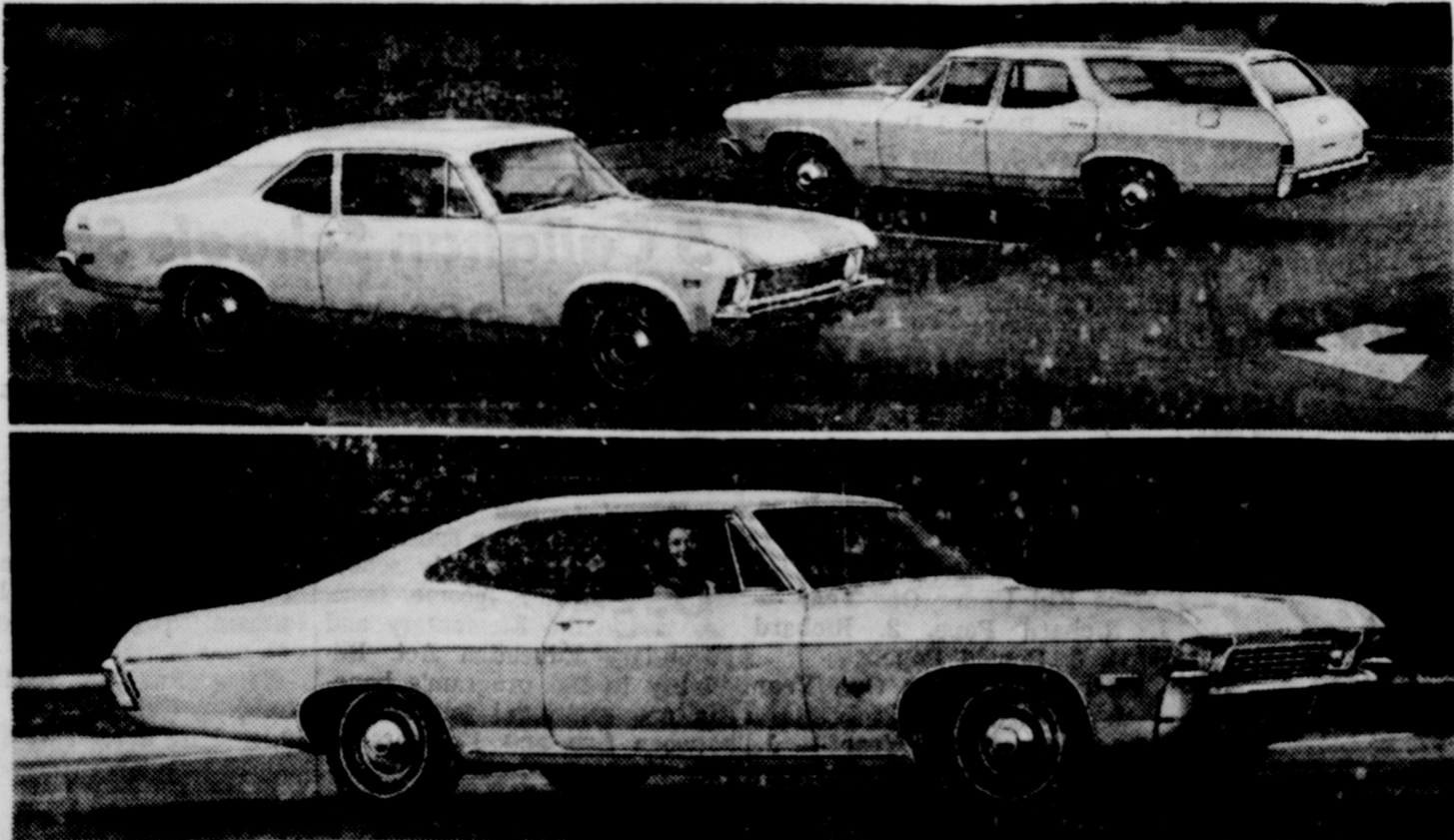
Nova Coupe and Nomad Station Wagon top, Impala Sport Coupe bottom.

Our lowest priced car—Nova Our lowest priced wagon—Nomad Chevrolet—low price is a tradition.