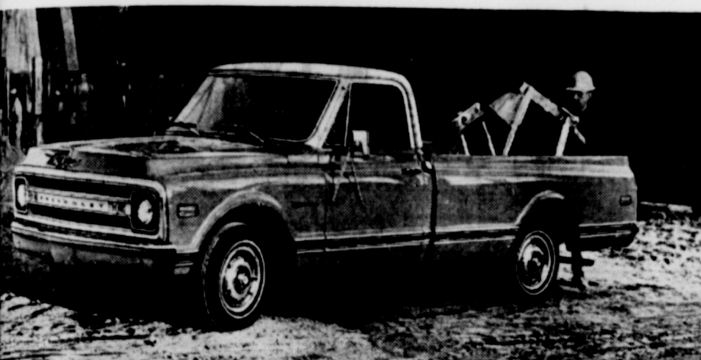
Restyled for a more massive front-end look, the 1969 Chevrolet light conventional truck line has numerous improvements. They include brighter interiors, tighter door sealing, new cab mounts for quieter ride, automatic choke, and foot-operated parking brake. New options include a 350-cu.-in. V8 and low-mounted side mirrors which afford better side vision and lower wind noise.

Ramey, son of Mr. Grady Ramey, is with the Army, and six-week-old Amy, and six-week-old Brant, are living in