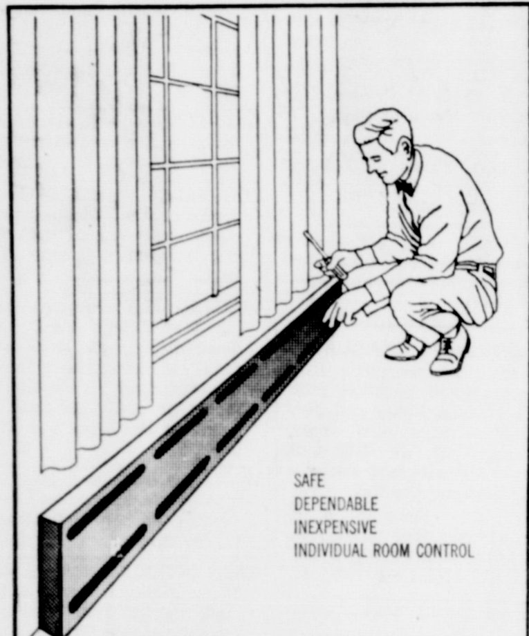
SAFE DEPENDABLE INEXPENSIVE INDIVIDUAL ROOM CONTROL