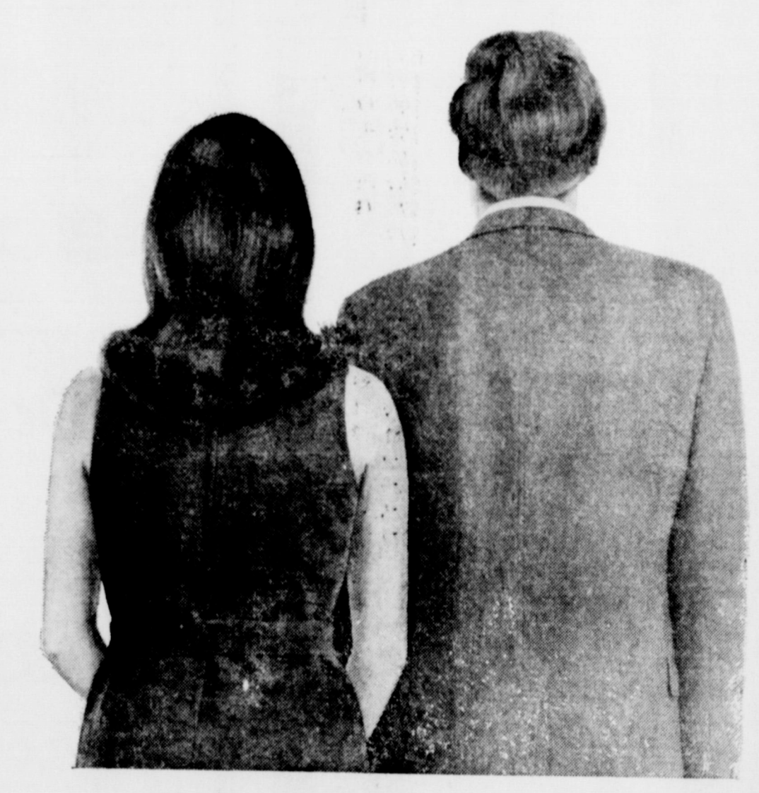
WE CAN HELP YOU BE A FART OF THE FUTURE

Whatever your hopes, your plans, your dreams, we can help you set them in operation now. If you need a savings plan, we have them to suit each family's situation. Or if you need a loan, we can arrange that too . . . on terms convenient to you.