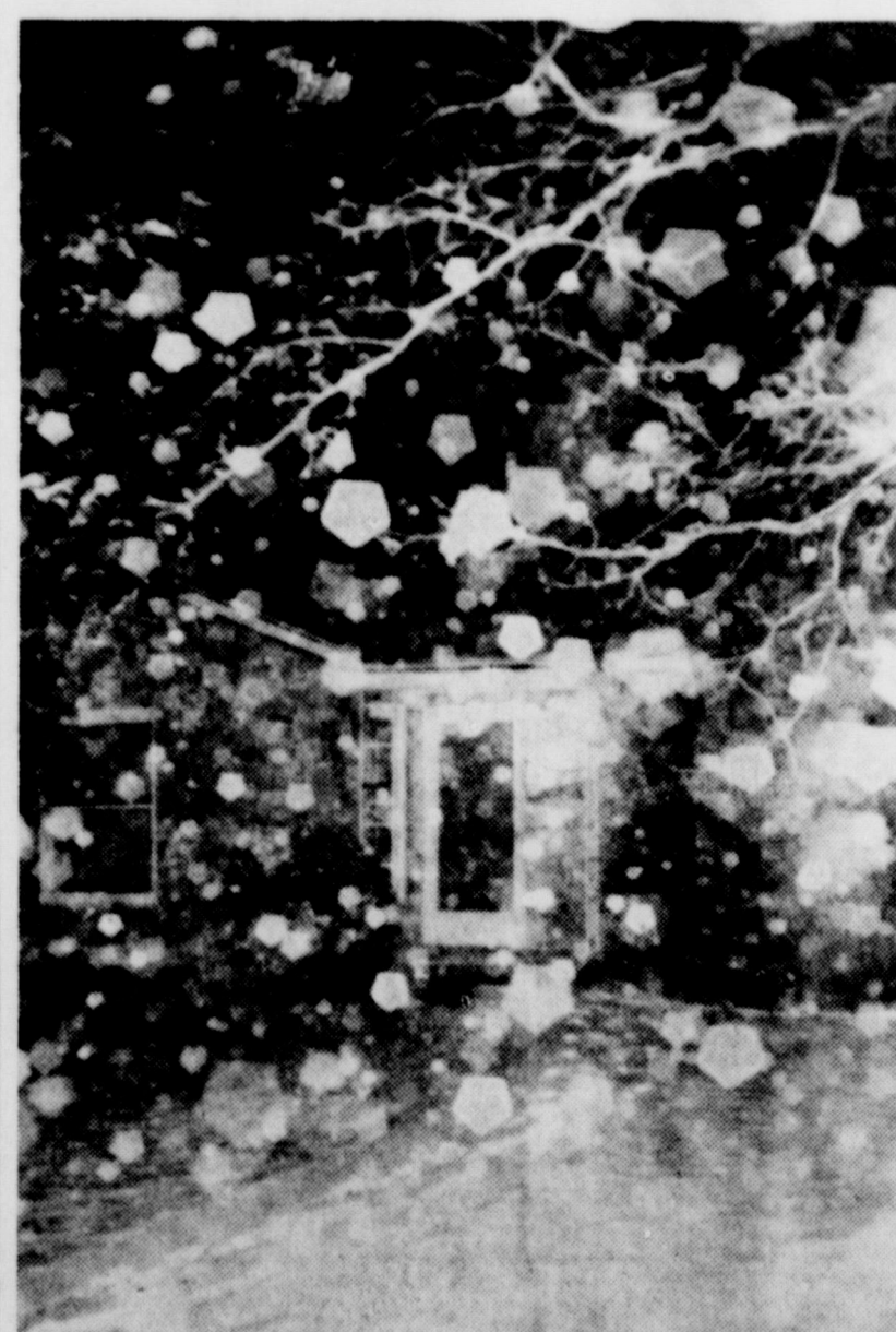
BIG SNOWFLAKES—Like other things in Texas snowflakes are also big as is proven in this picture. These odd-shaped, five-sided figures caught floating to the ground are actually snowflakes which fell here the night of January 10. The photo was taken by Mike Moore in front of his home on North Main Street. A flash bulb was used, and the resulting light reflections made the snowflakes appear as giant-sized pentagons.

Telephone 725-2341 to report fire in Cross Plains.