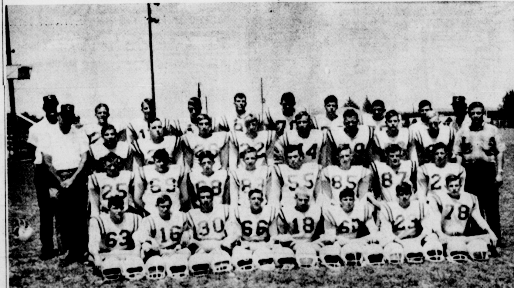
BUFFS OF 1967 —Shown here is the Cross Plains High School Buffaloes of 1967. Many of these gridgers are planning to return to Cross Plains and watch the 1973 Bisons tangle with the Rising Star Wildcats in homecoming game on September 29. That game will begin at

Wylie dropped a 20-0 decision to Rising Star last week, but that is qualified by injuries to key Bulldog personnel and an exceptionally strong Wildcat squad. Wylie is not exceptionally large, but possesses speed.