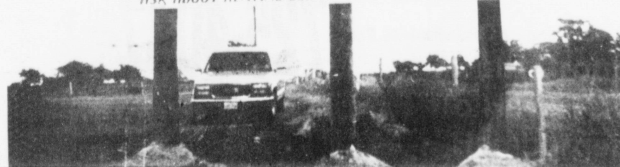
LAKEWOOD PROUDLY DISPLAYS NEW CLUB SIGN —Lakewood's new sign, located at the #1 green of the club's golf course, was designed by board director

LAKEWOOD RECREATION CENTER GOLF SWIMMING POOL FISHING CAMPING PUTT-PUTT GOLF PICNIC AREA PLAYGROUND PRO-SHOP (817) 643-7792 ASK ABOUT RENTING OUR FACILITIES FOR PRIVATE PARTIES