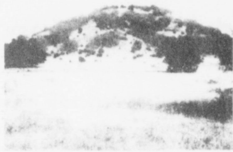
WEST CADDO PEAK