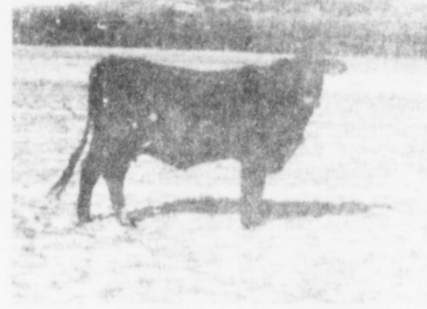
EAST CADDO PEAK Price 50¢