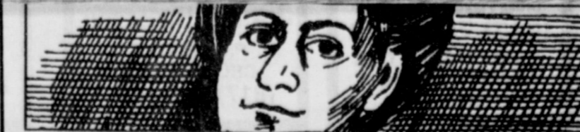
Martha Washington disliked being First Lady and often dressed so plainly that people mistook her for the family maid.