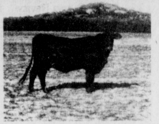
EAST CADDO PEAK Price 50¢