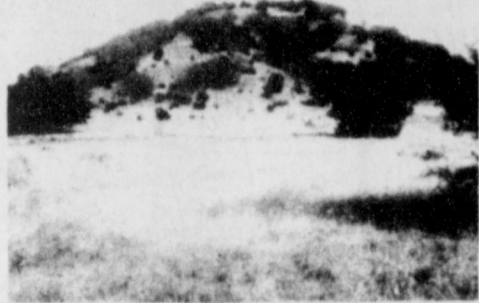
WEST CADDO PEAK