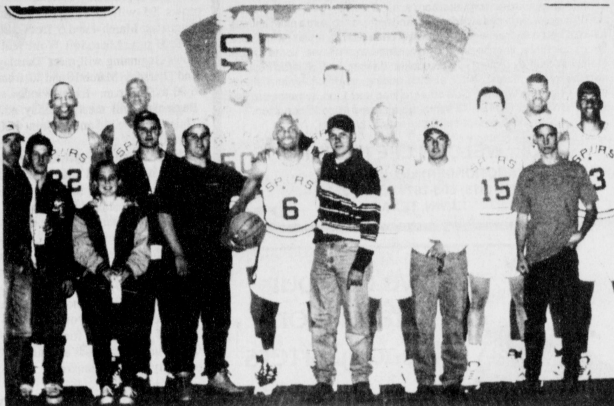
RUNNIN BUFFS PICTURED WITH SAN ANTONIO SPURS POSTERS