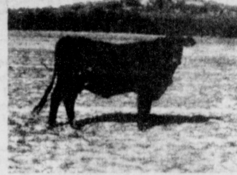
EAST CADDO PEAK Price 50¢