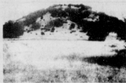
WEST CADDO PEAK