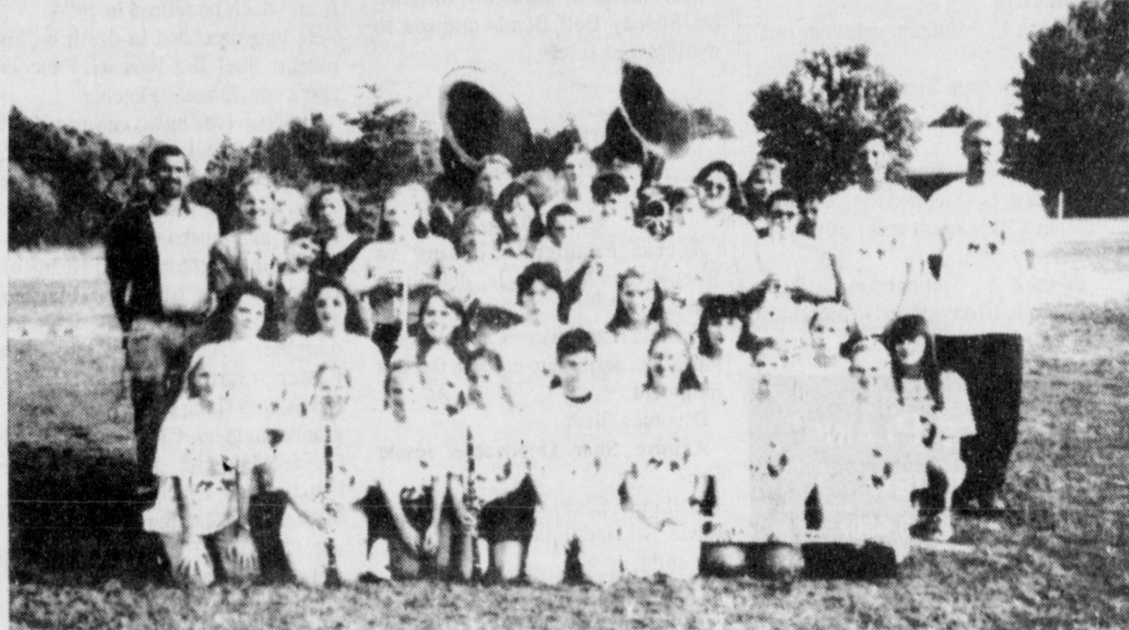
1997 BUFFALO MARCHING BAND