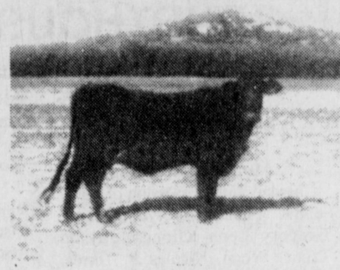
EAST CADDO PEAK Price 50c