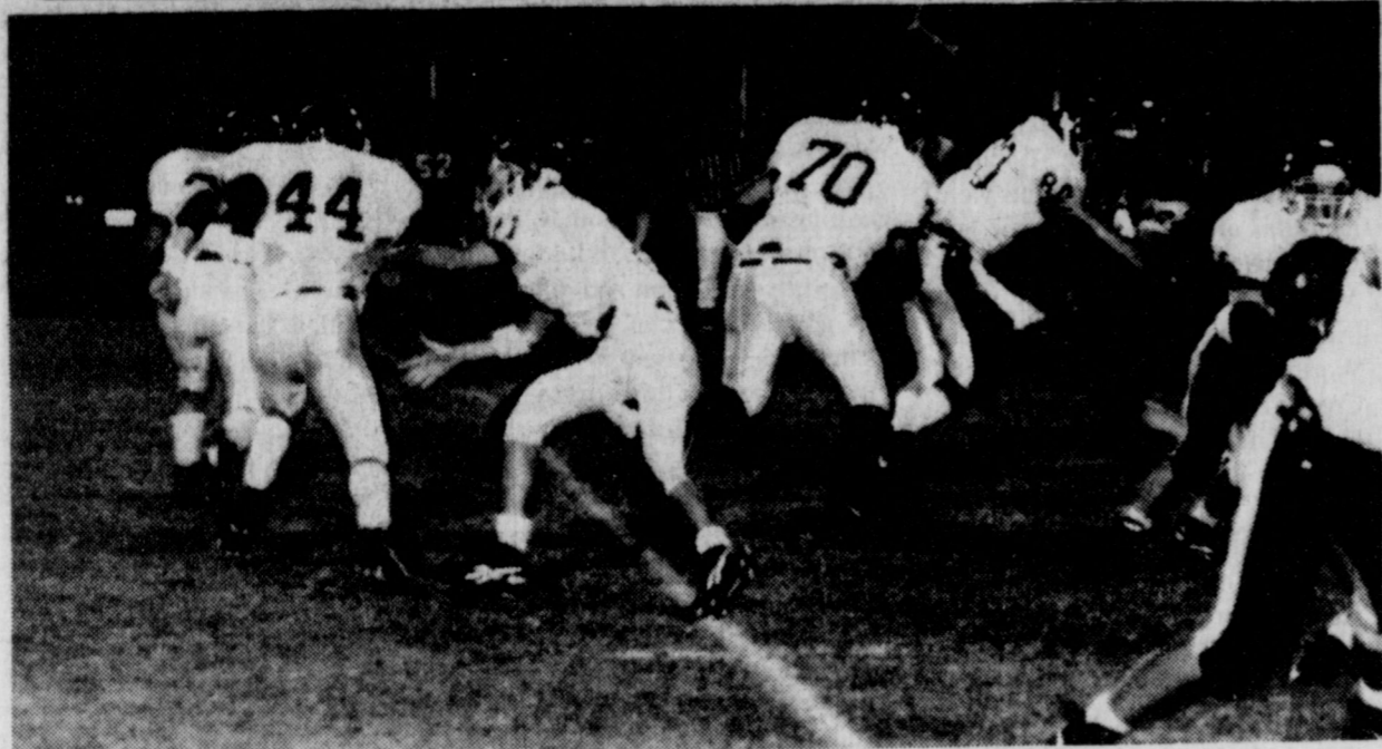
CROSS PLAINS BUFFALOES OFFENSE ON THE MOVE