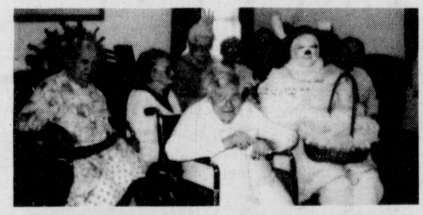
COLONIAL OAKS RESIDENTS ENJOY VISIT FROM EASTER BUNNY

Sunday: Believer's Fellowship A cheerful heart makes its own blue sky.