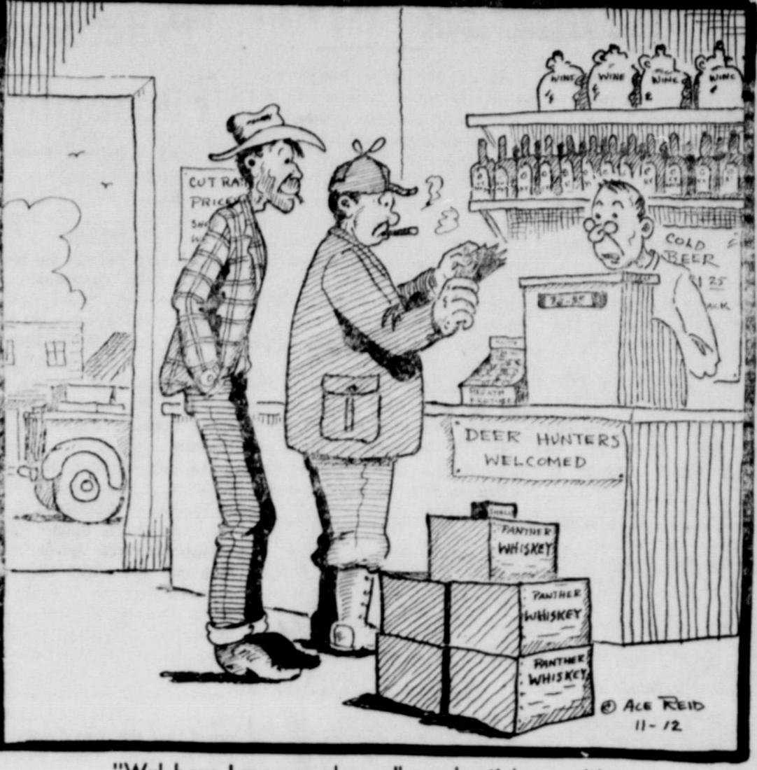
"Wul, boys, I guess you have all yore huntin' necessities ... five cases of whiskey and a box of shells!"