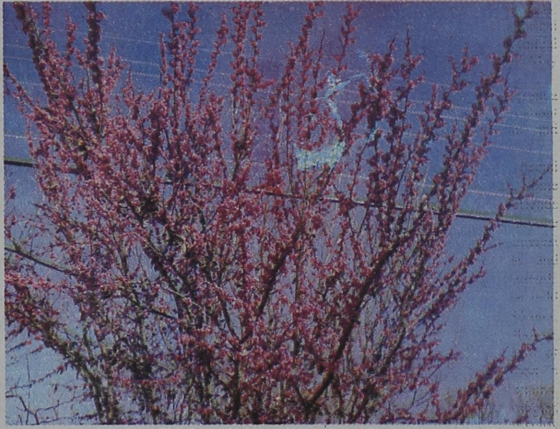
This beautiful peach tree is in bloom

Pursuant to the authority granted under Government Code, Chap. 551, the Commissioner's Court may convene a closed session to discuss any of the above agenda items. Immediately before any closed session, the specific section or sections of Government Code, Chap. 551 which provides statutory authority will be announced.