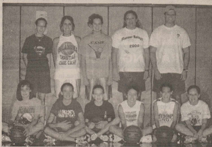
AFTERNOON SESSION—7th through 9th grades