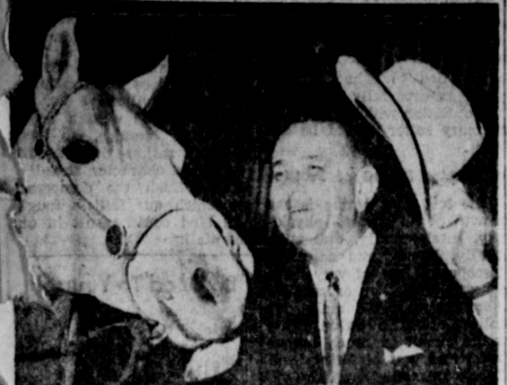
If Senator Lyndon B. Johnson decides to run in the 1960 Presidential Derby, he has a horse for the purpose. This four-year-old quarter horse was presented to the Senator by Tarrant County supporters at a recent appreciation dinner. Senator Johnson lifts his western-style hat in responsive appreciation.