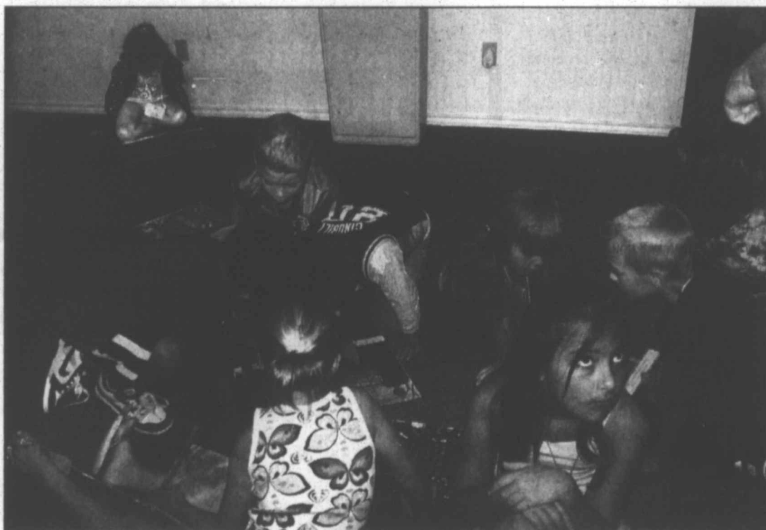
Interesting stories ... Several children are pictured here on the first day of the City/County Library's Summer Reading Program, featuring a "Reading Express" train theme.

that we've never had before. And it's not only an issue of eye appeal, which does affect your neighbors, but the real reason for controlling the weeds is that if you don't, you are likely to get a real problem with rodents, mosquitoes and even snakes,