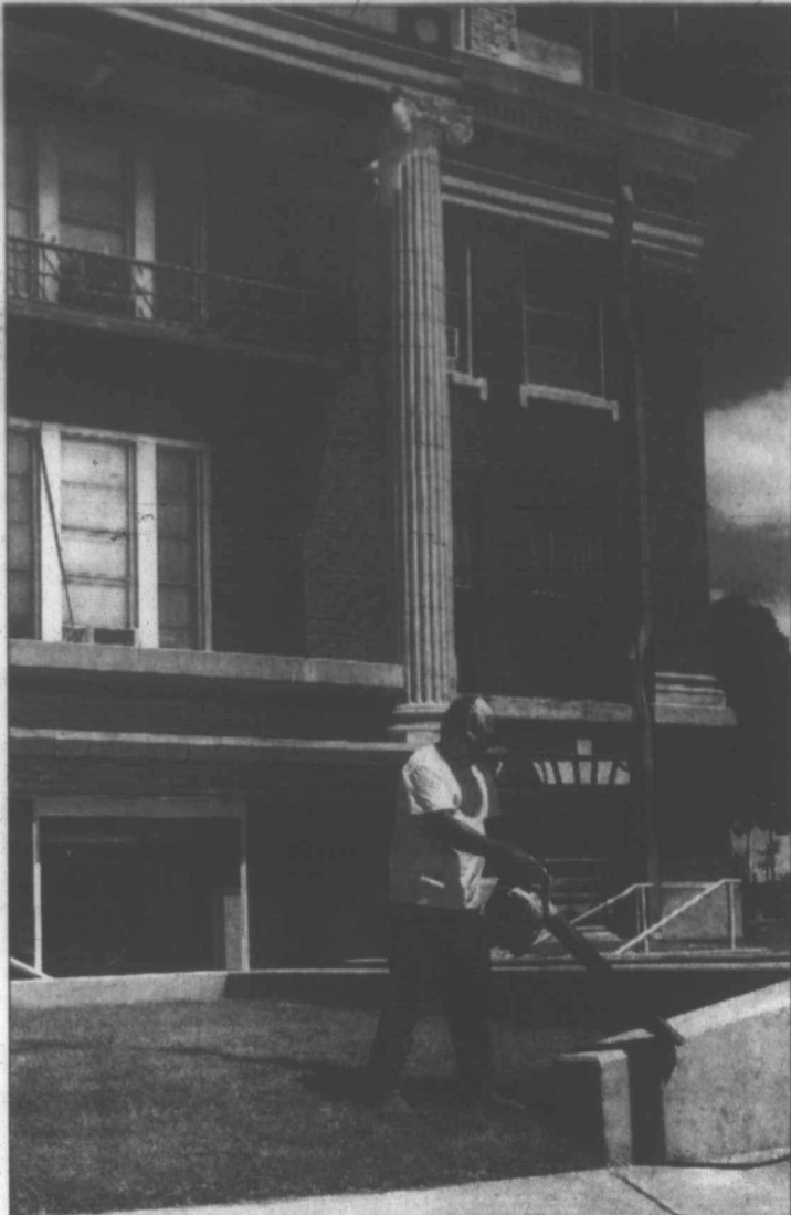
Sprucing up ... Rigo Avila spruces up the grounds at the Lynn County Courthouse, keeping the area trimmed and neat at all times, but also in preparation for KCBD's Live Community Coverage Tour which will broadcast News Channel 11 live from the courthouse grounds on Monday night. Citizens are invited to come out for the festivities by 5:30 p.m. and stay for live broadcasts of the 6 o'clock and 10 o'clock newscast.