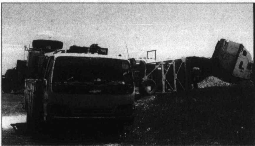
Gravel truck overturns... This 2001 Freightliner (in background) driven by an El Paso man and carrying a load of gravel overturned Monday morning at the intersection of U.S. 380 and FM 1328 west of Tahoka. There were no injuries.