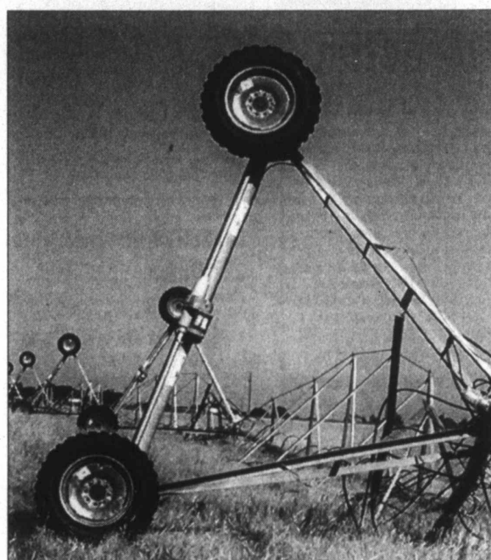
Wheels up... Upside down is not a good thing when it comes to pivot systems. Damages to this pivot happened on land just north of 8th St., in Tahoka, after last Thursday's storm.

The traditional closing ceremony was performed by the newly inducted officers.