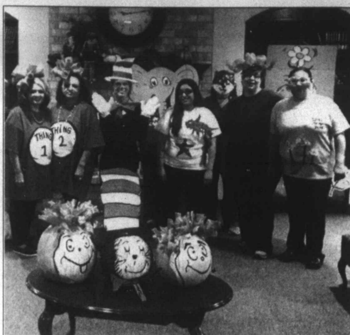
The Cat in the Hat ... Lynnwood staff turned the building into a living Dr. Seuss book for Halloween, dressing up as characters in the popular Dr. Seuss books for a fun day at Lynnwood Independent & Assisted Living Center.