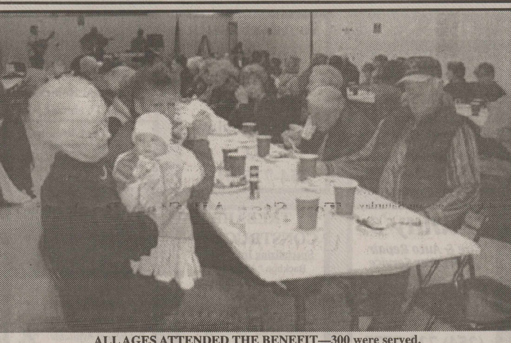
ALL AGES ATTENDED THE BENEFIT—300 were served.