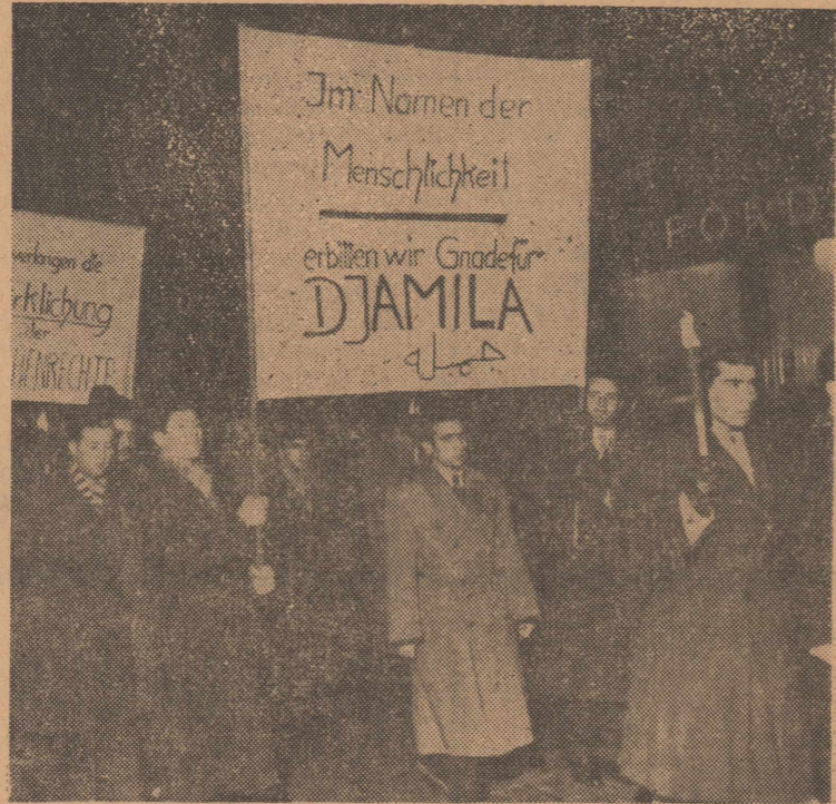
DEMONSTRATION WINS LIFE FOR REBEL — Carrying placards through the streets of Goettingen, Germany, an old university town. German and Afro-Asian students demonstrate for mercy for an Algerian rebel girl Djamilia Bouhired, who was sentenced to death by a French court for her rebel activities. French Pres. Rene Coty commuted the 22-year-old girl's sentence to life