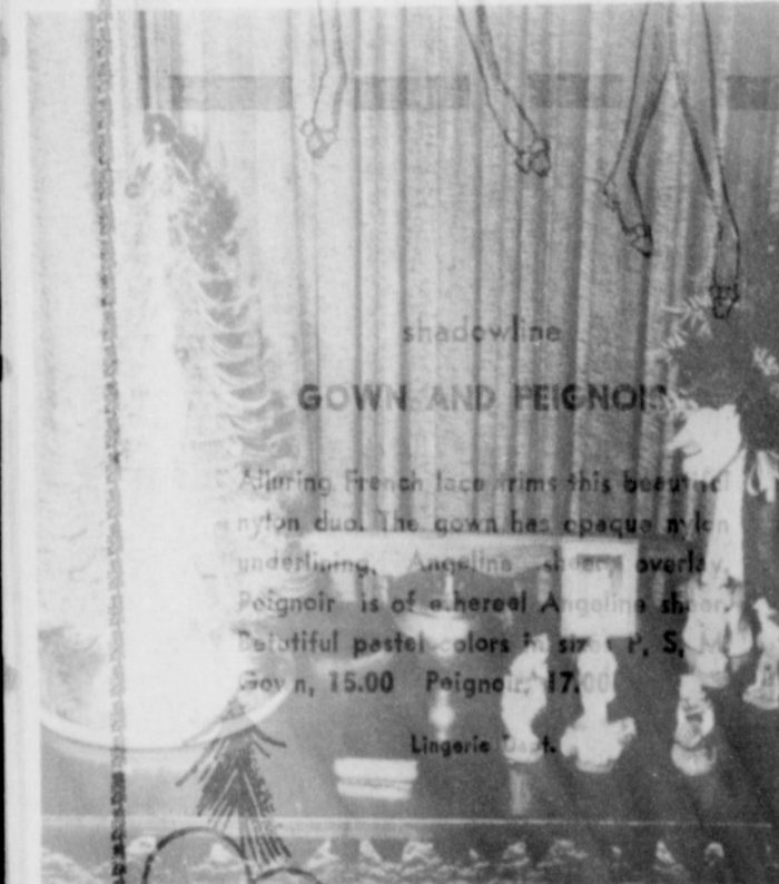
GOWN AND PEIGNOIR

While yarn is not cheap hand-made sweaters costing twenty-five to fifty dollars can be made for half the price and evening dresses of elegant materials can be made for half the cost if you are expert with the needle. One doesn't become expert without practice, however, so it is better to begin on simple styles and fabrics.