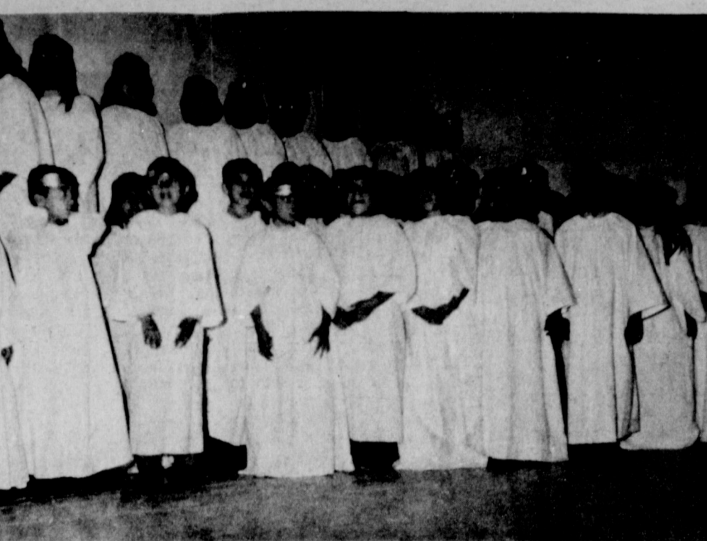
OH COME ALL YE FAITHFUL--This is the choir who sang at the annual Christmas program at the Catholic Center Sunday night. The youngsters represent just part of the many youngsters who took part in the program. A large crowd was on hand to see the children perform.