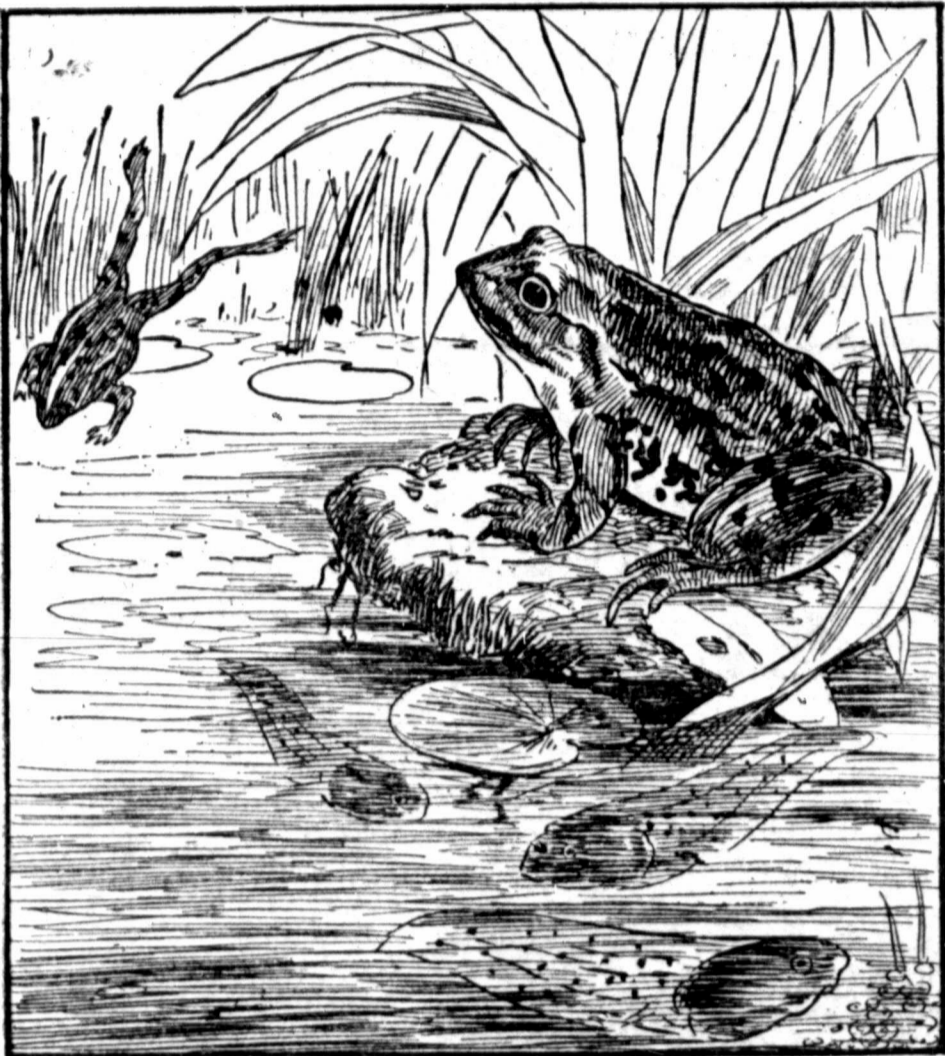
THE EDIBLE FROG