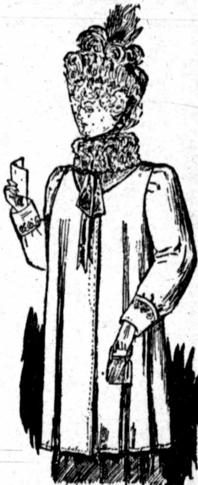
This is made in black face cloth, and is a simple sacque shape, a style which matrons always find so useful.

The loose bishop sleeve is set to a turn-back cuff of cloth, braided lightly at the edge, the collar being braided to match.