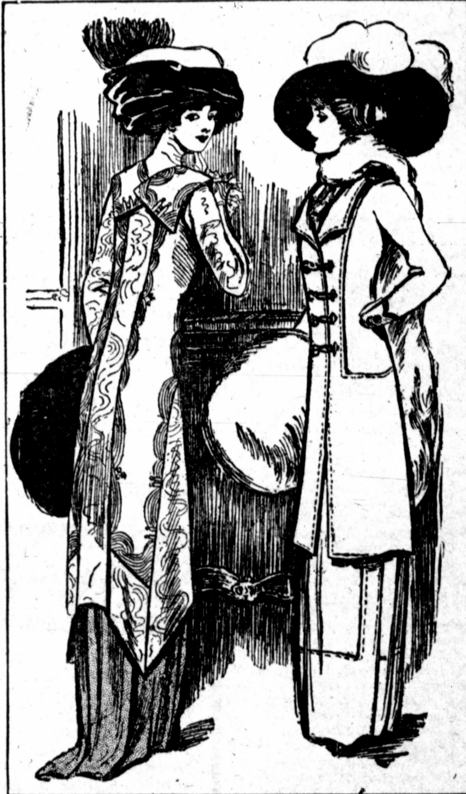
On the left is a long coat of gray cloth, trimmed with darker shade of braid—black velvet toque with gray, green and black aigrette. The second is a blue serge tailored suit, with collar and buttons of black satin, large black hat, with blue plumes.