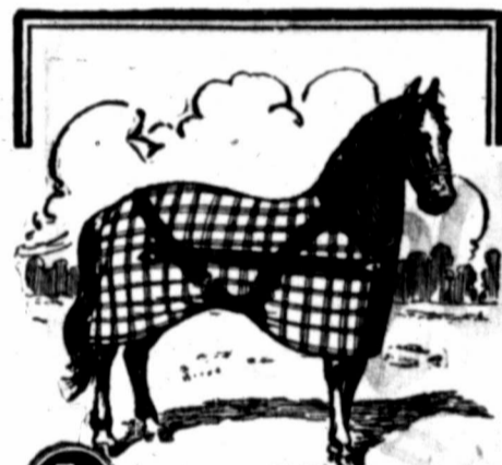
5A Horse Blankets

Blanket your horse in the stable and save feed. Keeps his coat sleek and saves you work. Ask for a 5A Stable Blanket. It will outwear three ordinary blankets. We get them direct from the factory.