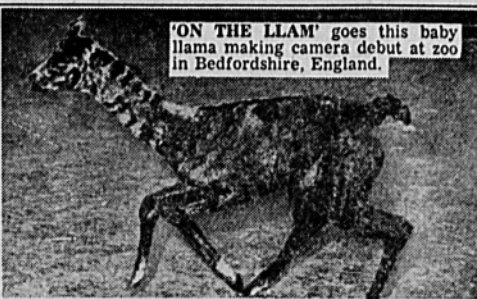
'ON THE LLAM' goes this baby llama making camera debut at zoo in Bedfordshire, England.