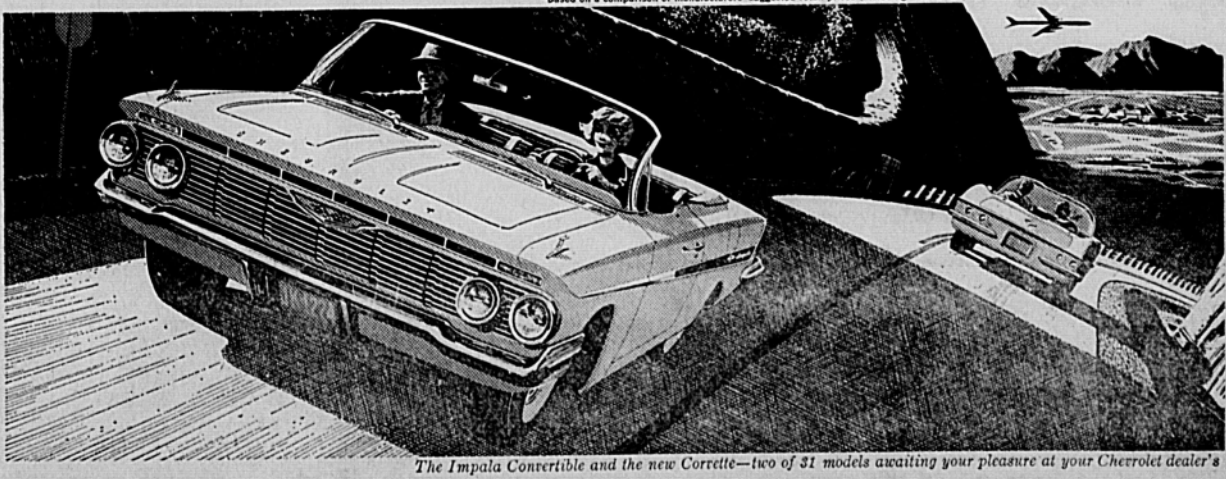
The Impala Convertible and the new Corvair—two of 31 models awaiting your pleasure at your Chevrolet dealer's

See the new Chevrolets at your local authorized Chevrolet dealer's One-Stop Shopping Center