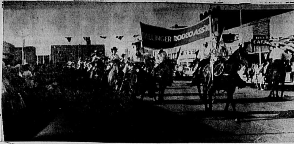
RODEO PARADE — Members of the Ballinger Rodeo Association, one of 15 Riding Clubs entered, are shown participating in the parade kicking off