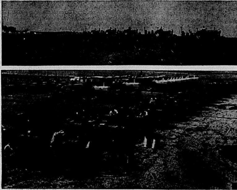
American agriculture is watching Greene County, Iowa, where a unique partnership between the corn and soybean growers and a farm equipment company has been started. All the farmers in Hardin Township have been offered the use of new Ford tractors and planters to seed their 1961 crops. At top, 31 Ford tractors and planters take the field as the planting season opens. The 84 cooperating farmers will plant 12,339 acres with the new equipment. At bottom, an "assembly line" in miniature was set up by the Operation Corn Planter crew to ready the equipment for the farmers' use.