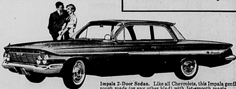
Impala 2-Door Sedan. Like all Chevrolets, this Impala gentles rough roads (or any other kind) with Jet-smooth magic.

See the new Chevrolets at your local authorized Chevrolet dealer's One-Stop Shopping Center