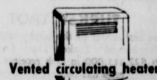
Vented circulating heaters

A size for every room! Lots of healthful instant heat for your money! They circulate heat both outward and upward. Flue-vented—helps prevent window sweating. Modern console cabinets blend into any room.