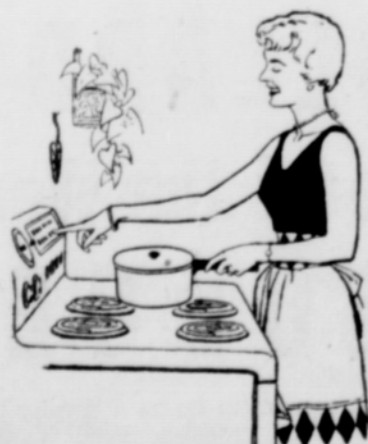
WORK IN COMFORT—electric range helps keep cook and kitchen cooler.

MORE COMFORT WHEN YOU LIVE ELECTRICALLY!