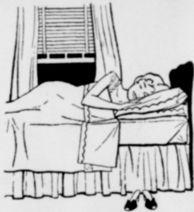
SLEEP IN COMFORT—Electric room air conditioners help keep bedrooms cool.

MORE COMFORT WHEN YOU LIVE ELECTRICALLY!