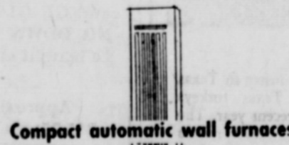
Compact automatic wall furnaces

Buy Ward or Empire automatic, worry-free furnaces at discount. Just set controls and your house stays comfortably warm. Economical—you get only the heat you need. Complete range of models and capacities.