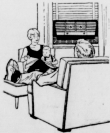
RELAX IN COMFORT in your air conditioned living room.

*Electric service, today's biggest bargain. In West Texas homes, the average cost of a kilowatt-hour of electric service is 22% less than it was 10 years ago.