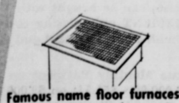
Famous name floor furnaces

All closet-type and floor-type central furnaces on sale.