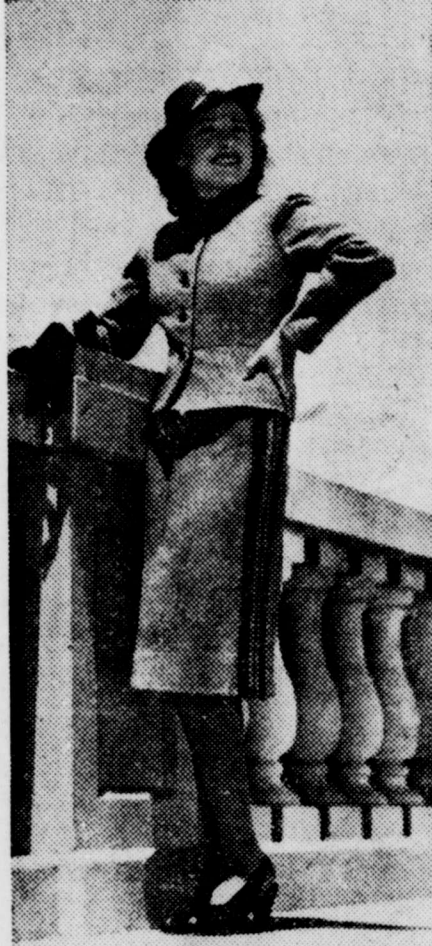
Into Fall, and Laraine Day chooses this two-piece suit with cadets jacket featuring high collar in dark green felt, flat silver buttons and cadet's stripes in dark green felt down the skirt.