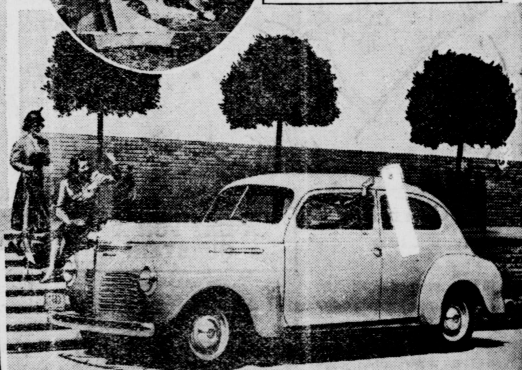
COMPLETELY NEW from bumper to bumper is this 1940 Plymouth just announced, presenting a new concept of size and luxury obtainable in cars for the low price field. Stronger "eye appeal" is a feature, while the new 117-inch wheelbase permits a longer, wider, lower body containing much more passenger room, providing a new kind of "luxury ride." The car shown is the "Roadking" 2-Door Sedan.