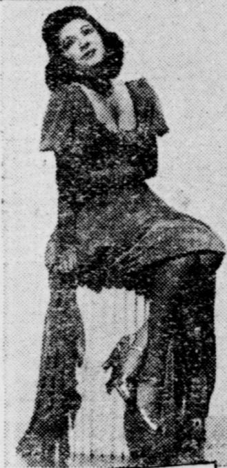
FALL DANCE FROCK— Bea Wain, featured soloist on the Hit Parade program, demonstrates the Fall trend in this salmon toned dinner dress of delicate chiffon. The high Empire waistline lends height and grace, while the wide skirt permits ease in dancing.