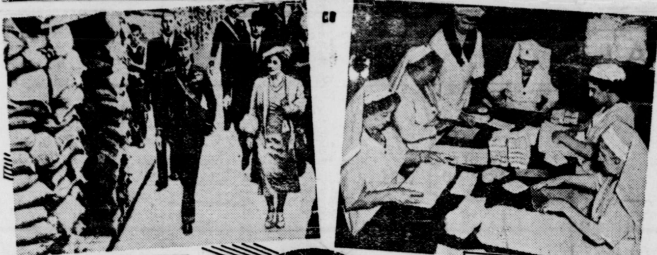
KING GEORGE AND QUEEN ELIZABETH carrying gas masks are shown inspecting the sand-bagged walls of an air raid shelter in London. The King wears the light blue uniform of a Marshall of the Royal Air Force and the Queen is dressed in a pale blue gown.