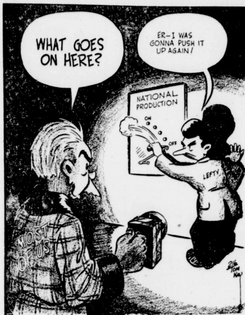
Caught In The Act

Typewriter Paper at The News-Record Shop