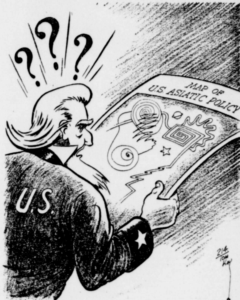
A Chinese Puzzle