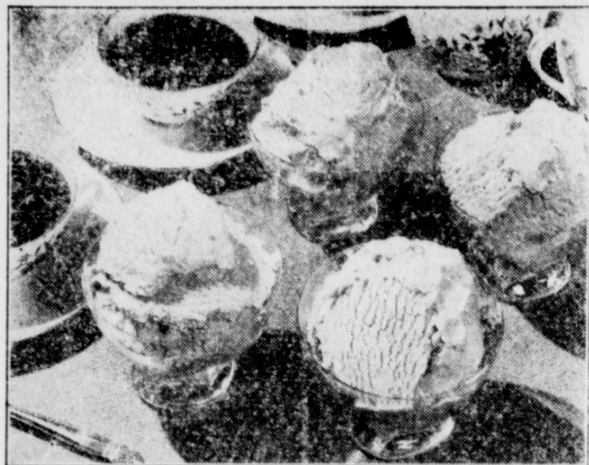
By BETTY BARCLAY

Summer is here again when those sunny moments and whiffs of fresh air have a drastic effect on healthy appetites. You'll want to keep a cool, filling dessert ready to serve on a moment's notice when family and friends troop in from work or play.