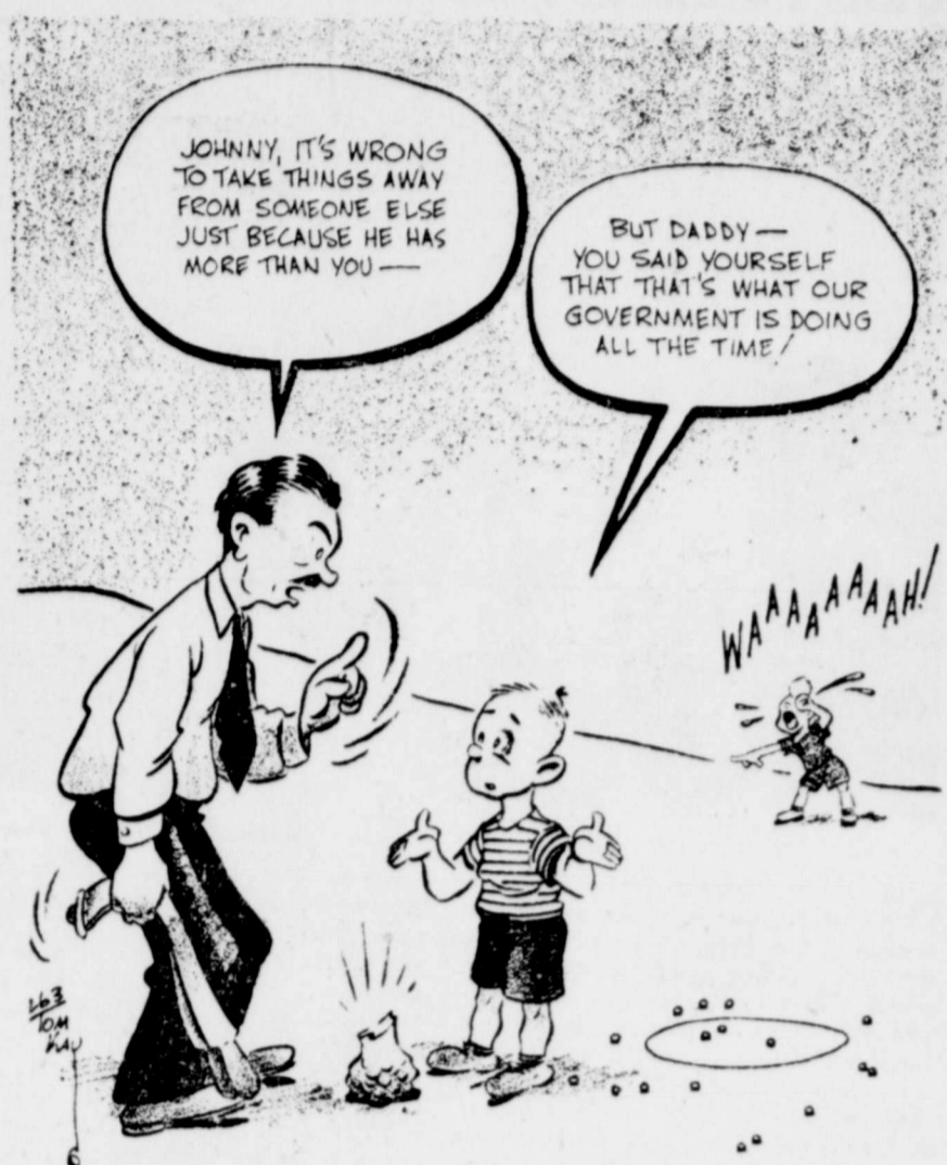
No Wonder Johnny's Puzzled