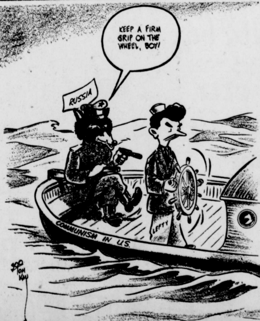
Asleep On The Deep