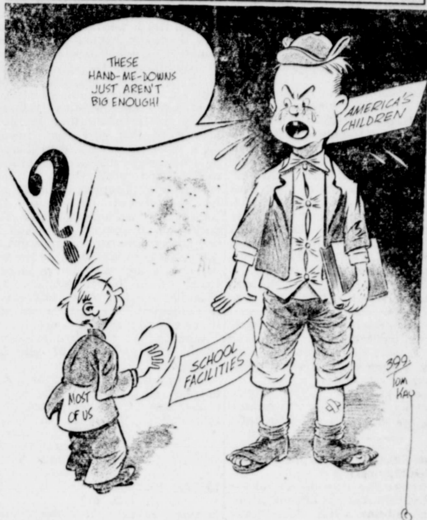
Junior Needs a New Suit of Clothes

Notice to Tired Housewife—Persuade your husband to bring you and the kids to Carter's Cafe for Sunday dinner and the whole family will be happy. (adv.) Try Carter's Cafe & Grocery for your favorite style steaks, plate lunches. Open all day Sunday—5c coffee. (adv.) Drinking Cups at News-Record.