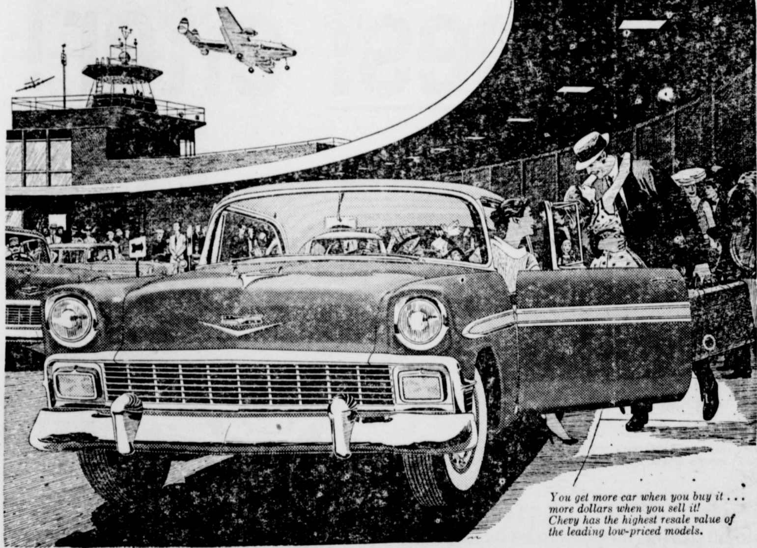
You get more car when you buy it... more dollars when you sell it! Chevy has the highest resale value of the leading low-priced models.

(All appointments not cancelled 1 hour before time to be charged for)