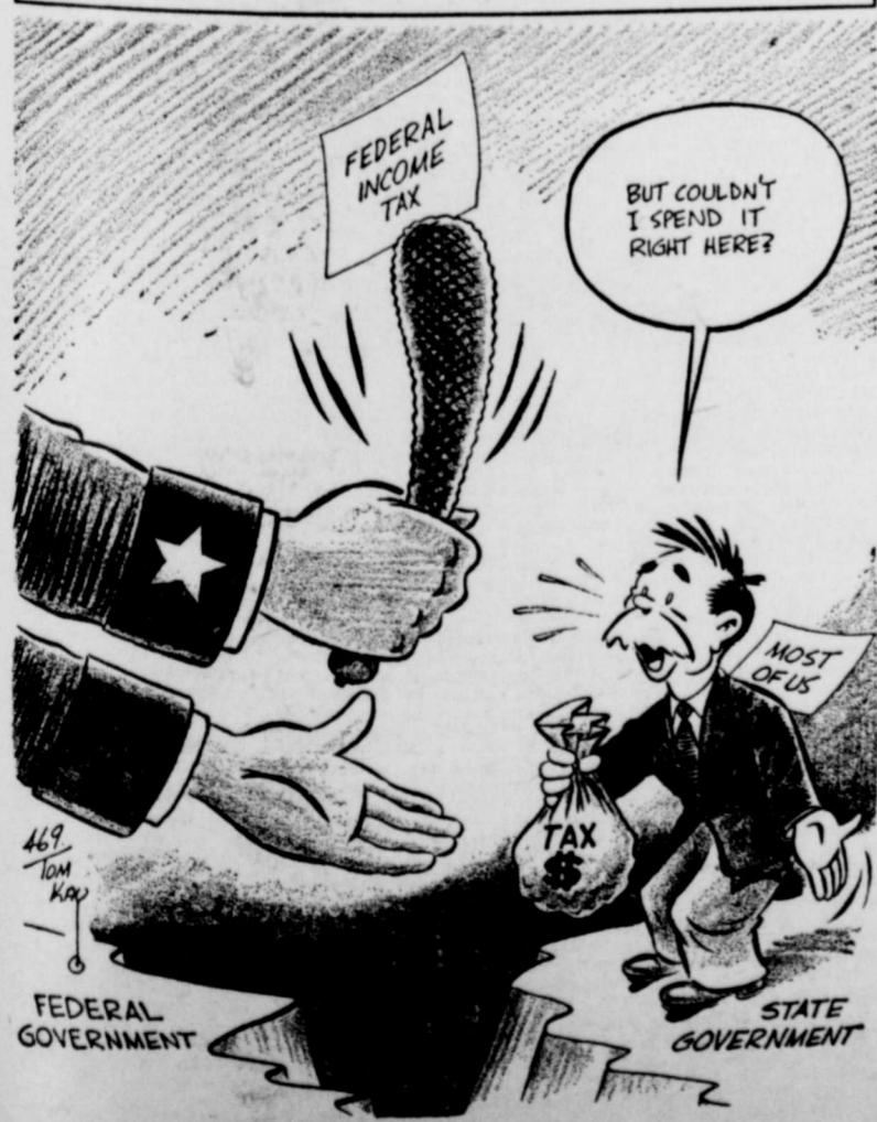
A Most Sensible Question