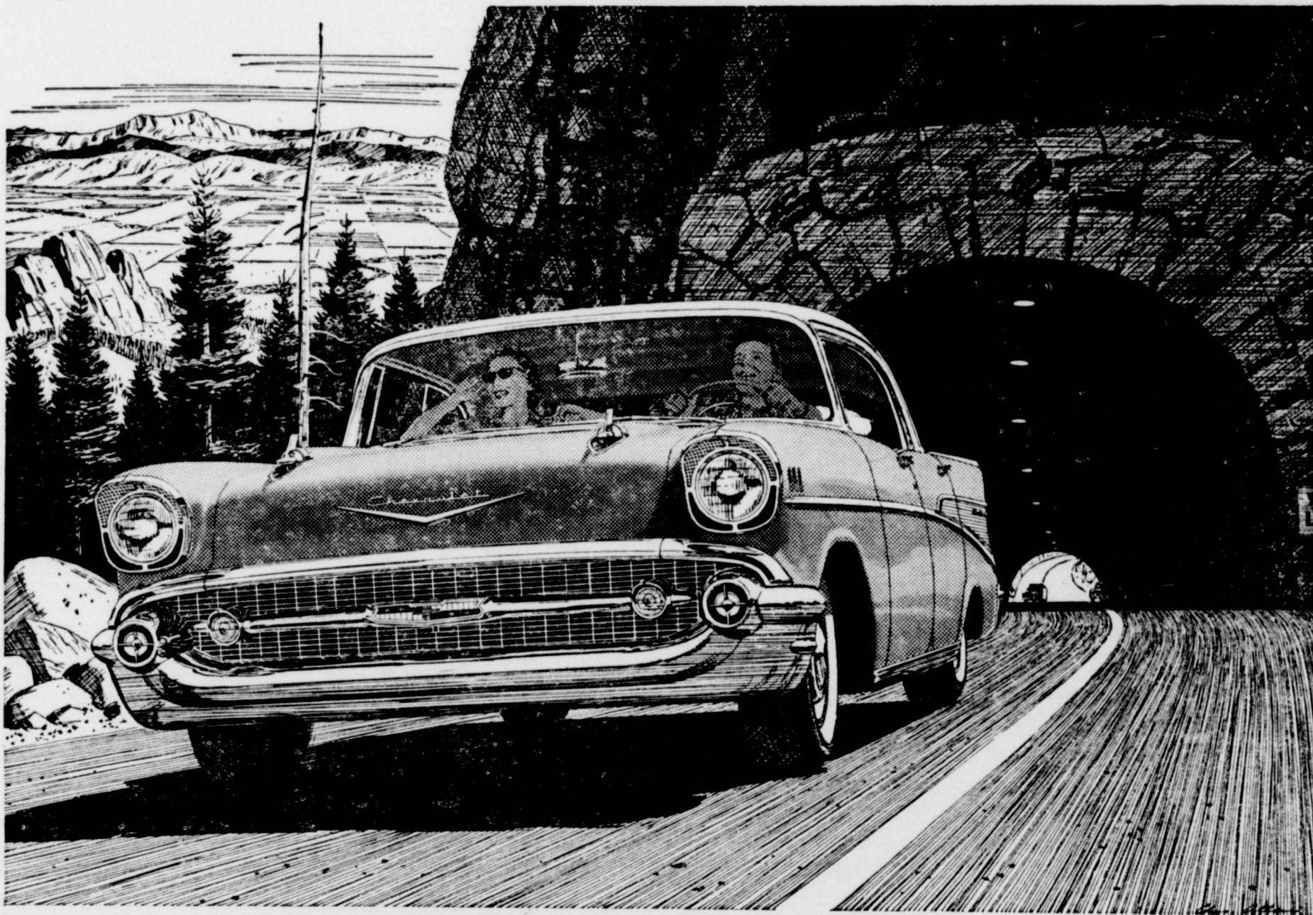
Beauty in motion—Chevrolet Bel Air Sport Sedan with Body by Fisher.

DON'T BUY ANY CAR BEFORE YOU DRIVE A CHEVY... ITS BEST SHOWROOM IS THE ROAD.