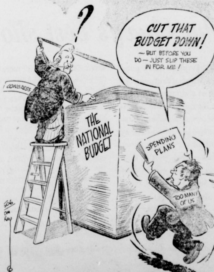
Pity the Poor Congress!