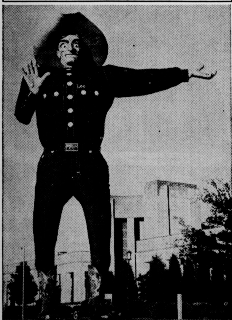
"Big Tex," the towering 52-foot cowboy statue who rules as the symbol of the great State Fair of Texas, is ready to welcome some two-and-a-half million visitors to the giant exposition in Dallas, October 4 through 19.