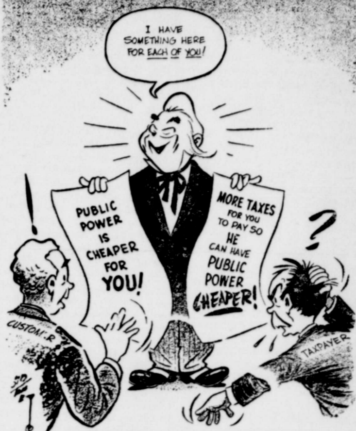
Socialism -- Sneaky Style