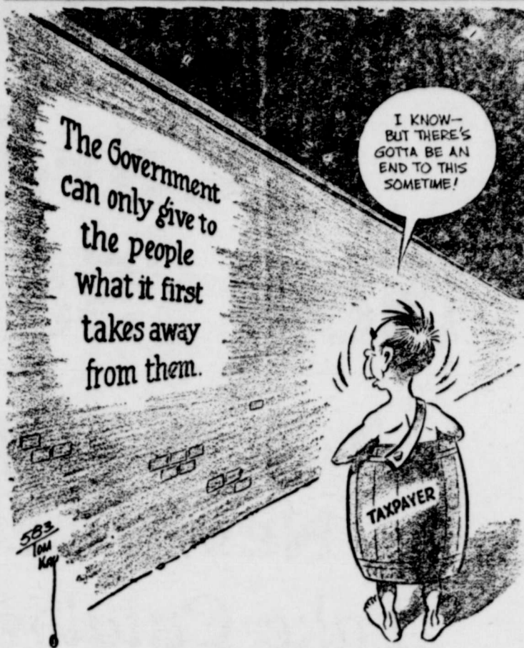
Not Much Left to Take