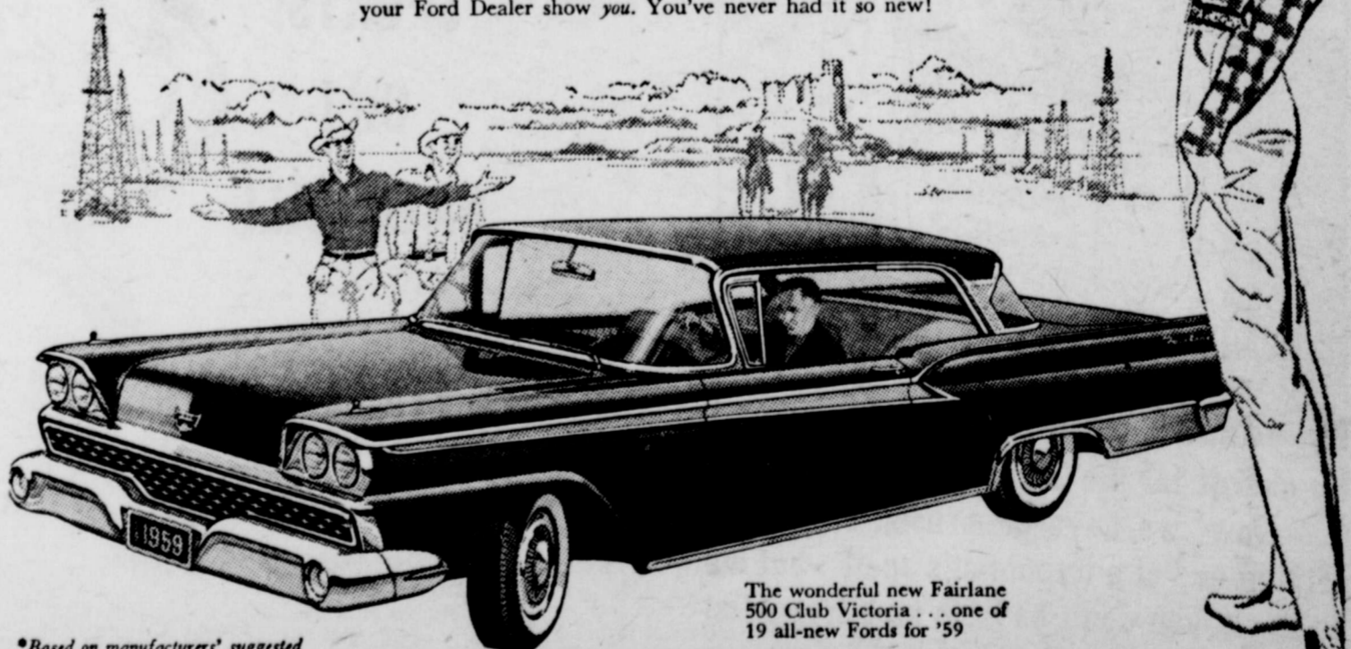
The wonderful new Fairlane 500 Club Victoria . . . one of 19 all-new Fords for '59

Look for newness everywhere . . . right down to the new Tyrex tires. Let your Ford Dealer show you. You've never had it so new!