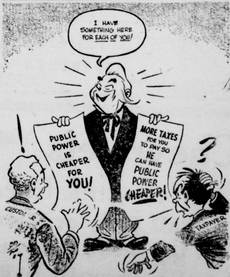
Socialism -- Sneaky Style