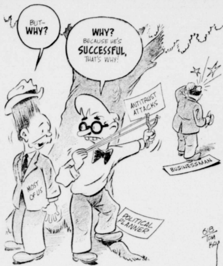
The Penalty of Efficiency