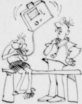
PORTABLE BREATH TESTING to determine certain lung functions can be done with the Pulmonary Function Indicator from National Cylinder Gas, Chicago. Testing can be done conveniently at bedside, in doctors' offices, clinics and mobile units, NCG said.