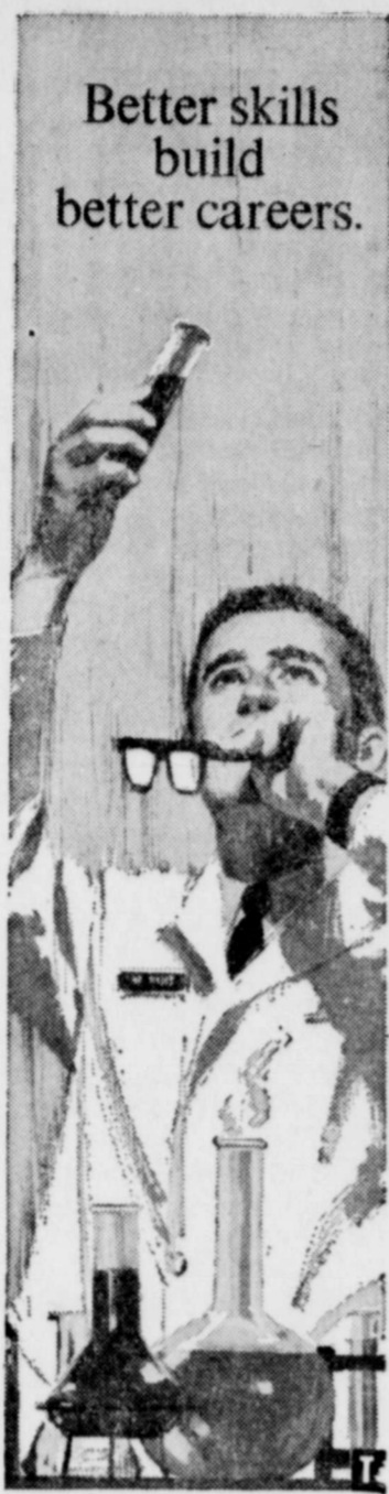
The U.S. Army Reserve,

adult to contact the social security office immediately if the child will be a full-time student at age 18.